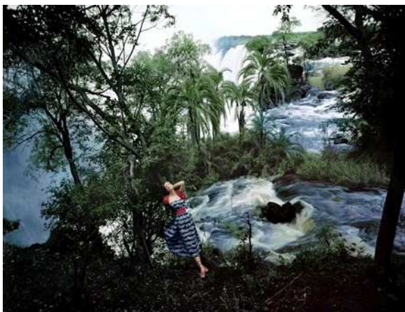
Fig. 2. Place: Niger. Published in US Vogue (July 1951).

In the late 1940s, there was a burgeoning trend in Vogue to use for the first time