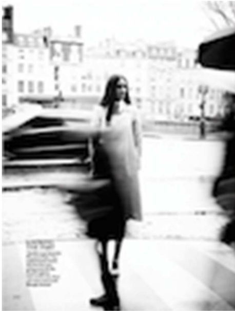
Fig. 3. Place: Paris. Published in Vogue India (September 2015).

experience that, on the other side, has provided them the opportunity to access to high-end shopping venues around the world. Thus, fashion magazine like Vogue has shortened geographical distances in two directions. On one hand, running in parallel with the recent emergence of retailing in Eastern Europe and Asia-Pacific it is a vehicle for the promotion of international brands flocking to those territories. As Djurdja Bartlett (2006: 176) asserted regarding Russian Vogue : “Western fashion, which had colonized Soviet women’s subconscious for decades, had finally arrived”.