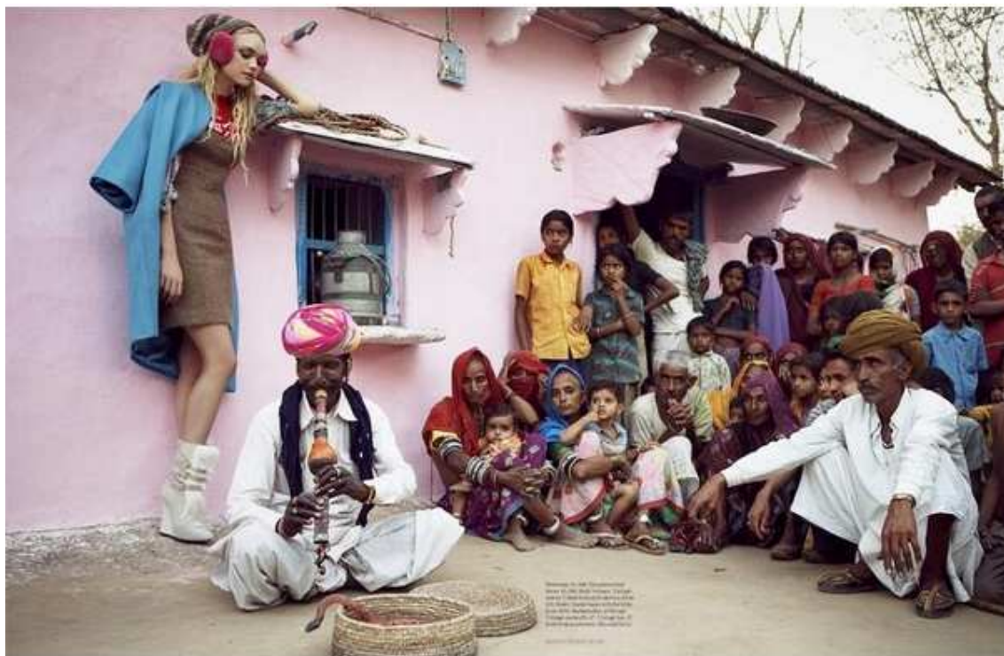
Fig. 18. Place: India. Published in British Vogue (September 1997).

However, moving fashion photography to places away from the geographies if its consumption may be offensive, not so much for mixing luxury with underprivileged