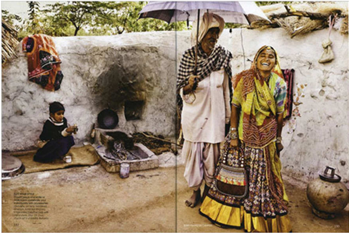
Fig. 19. Place: India. Published in Vogue India (August 2008).

As the newspaper wrote, in answer to criticism from within India, the fashion system based its defense on the trivial and playful nature of its images, as well as the industry's ability to reduce the level of poverty in the country. With the heading “ Welcome to the new India — at least as Vogue sees it ” (Craik 1994: 26-27), the economics correspondent of The New York Times ironically took up the tone of national promotion of the August number that Vogue titled the “India Issue.”