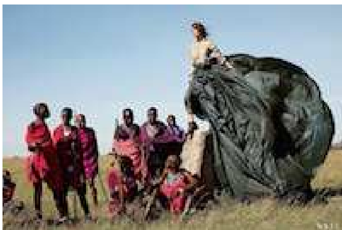
Fig. 5. Place: Kenya. Published in British Vogue (June 2007).

With no attempt to blend in with the conditions and customs of the place, and in order to idealize the experience of the exotic, this type of photo shoots provides a simplified,