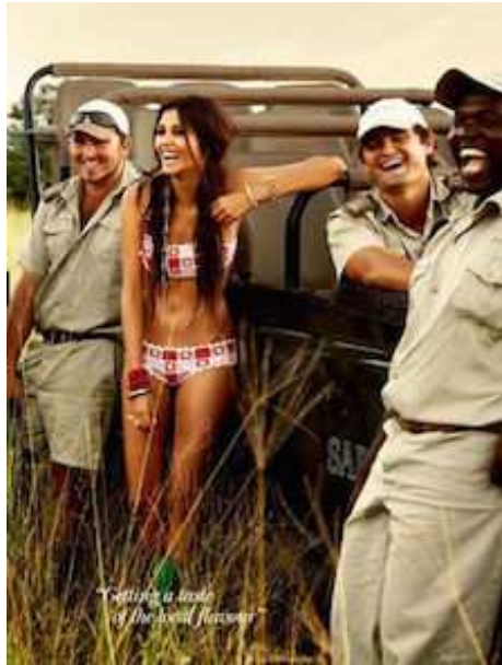
Fig. 6. Place: Kenya. Published in Vogue India (April 2011).

Nevertheless, when some non-Western fashion magazines use their native