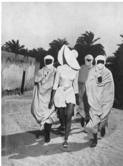
Fig. 8. Place: Tunis. Published in British Vogue (May 1967).

The devices used to make ethnicity an effective tool for the promotion of fashion became as complex as the meanings of this type of photography. The tensions arising from the contact between fashion and societies that are beyond its influence have been partially relieved through strategies of composition and narration, which tend to blur the limits that separate fashionable dress practices and codes from an ethnicity that represents values such as temporal stability. In this sense, two mechanisms for representation stand out: the active participation (dramatized or realistic) of native subjects in the construction of the fashion image, to the brink of incarnating it, and the melding of the model into the surroundings until she emulates the ethnic subject.