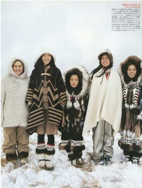
Fig. 12. Place: Alaska. Published in Vogue Japan (February 1999).

At this last discursive level of fashion ethno-iconography, it is noteworthy to mention the type of images in which the model manages to become a recreation of the local people of the country where she is posing for the shoot. Amongst the non-Western cases explored, the images published in 1999 in Vogue Japan for an editorial that invited the reader to visit the village of the Inuit provides a remarkable example of that tendency. The photographer Anne Menke articulated a serene, natural symbiosis between a Japanese model, the locations and the indigenous people of Alaska, the Inuit (fig. 12). In this way, fashion did not proclaim to be present among or even assimilated by, minorities and places far away from its capital cities, but to be something that had sprung directly from