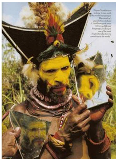
Fig. 10. Place: Papua New Guinea. Published in British Vogue (August 2007).

Decades later, Inez & Vinoodh obtained a similar effect for an editorial published in February 2010 for Vogue Paris . In the photographic series, the model Daria Werbowy is accompanied by a male Moroccan who interacts with her by holding her arm or resting his hand on her shoulder. As with Newton's Berbers, the invitation to play a dramatized role in the photo makes the native become an active element in fashion image making. With this mechanism, Inez & Vinoodh generate a discourse loaded with social significance through dialogue between opposing codes. Indeed, to the extent that the native is always portrayed wearing the traditional djellaba – the loose and long hooded upper garment with full sleeves -, he becomes a fixed and stable constant for the series of images that aim to show the model's changes. In addition to acting