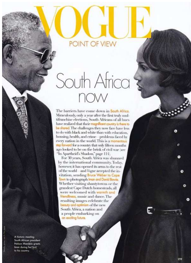
Fig. 17. Place: South Africa. Published in US Vogue (June 1995).

It is remarkable the picture of the Somali model with a Jacqueline Kennedy look while she shook hands with the newly appointed president of South Africa in another section titled “South Africa Now” (fig. 17). The visual rhetoric provided the picture with the air of a diplomatic meeting with a magnificent country, which, as explained in the text, was opening its arms to the world in order “to be shared” ( US Vogue , 1996: 159). In this way, the magazine not only becomes a platform for South Africa to tell the world of its project as a nation. It also positions itself in the front row of a multilateral model of relations between countries where