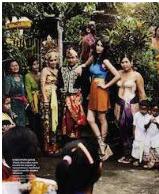
Fig. 11. Place: Bali. Published in Vogue India (April 2011).

Similar approaches to the ethnic dress of other countries are found in non-Western editions. An illustrative example of these practices is offered by "Paradise Found,"