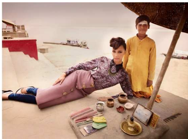
Fig. 7. Place: India. Published in Vogue India (September 2012).

However, this proud reaffirmation of the vernacular that seems to survive the