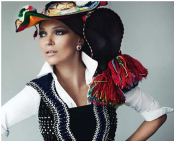
Fig. 16. Place: Studio. Published in Vogue Paris (April 2013).

There also exists a semantic dimension that cannot be ignored and that depends on the frequent intersection of fashion and ethno-iconography with documentary photography. In 1995, US Vogue proved this potential with an editorial entitled “Traveling with style,” in which Bruce Weber photographed Somali model Iman and her husband, David Bowie, on a trip to South Africa. Bordering on the language of photojournalism, the pictures celebrated a country moving towards a