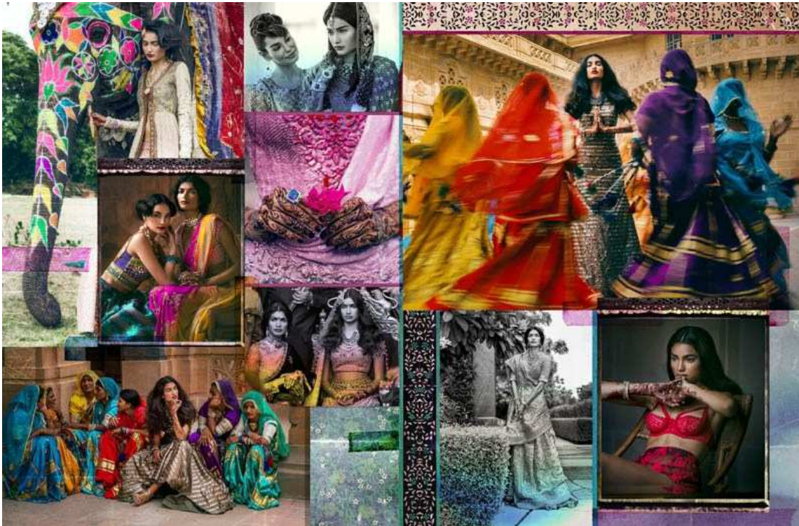
Fig. 13. Place: India. Published in Vogue India (November 2013).

In this regard, non-Western editions make room for native fashion brands, taking them out of the marginality. For instance, in “Rites of Passage,” published in Vogue India , designs by Dolce & Gabbana, Christian Louboutin or Myla figure as mere complements overshadowed by the impressive outfits created by pioneers of Indian fashion industry and successful designers like Sabyasachi Mukherjee, Arpita Mehta, Anushka Khanna or Pallavi Jaikishan. The editorial, with photographs by Signe Vilstrup, is halfway between a photographic album of memories and an ethnographic report that illustrates one of the oldest traditions in India (fig. 13), a wedding. In fact, the beautiful compositions evoke the aesthetics of princely India photographed in the nineteenth century by the Indian Raja Deendayal. 5 The images of the editorial translate some of the rituals related with the ceremony, like the Pithi Dastoor – during which the groom and the bride are painted with a paste of turmeric and sandalwood – or the Mehfils – which consists in the gathering of guests and family. But the Romanticism and the Bollywood dreamlike grammar contrast with the reality of a society in which women are still submitted to the drama of arranged marriages.