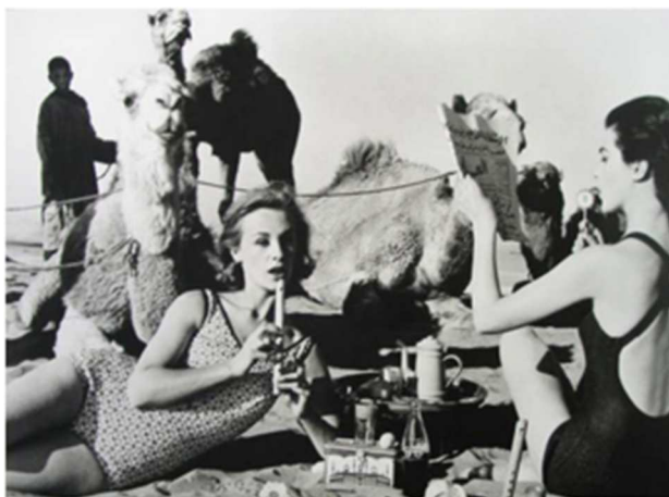
Fig. 4. Place: Morocco. Published in US Vogue (June 1958).

On the other hand, it must be considered that many photographic editorials published in these non-Western editions also use foreign locations. Taking the study case of Vogue India , editorials like “April in Paris”, published in September 2015 (fig. 3), provides the viewer/reader the experience of virtually traveling to France. Also to the USA and even the United Arab Emirates or Egypt. Apart from elitist buyers, the target audience of that magazine is also represented by “aspiring epicures” consumers who are not rich, but admire prestigious Western brands and want to be part of the world of luxury. 3 For these specific readers, virtually traveling to cities like Paris or Dubai or exploring the Sabi Sabi Game Reserve in South Africa is also a way of dreaming a world of unaffordable and desired sophistication.