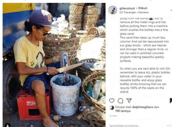
Figure 01: Gili Eco Trust posts on Instagram